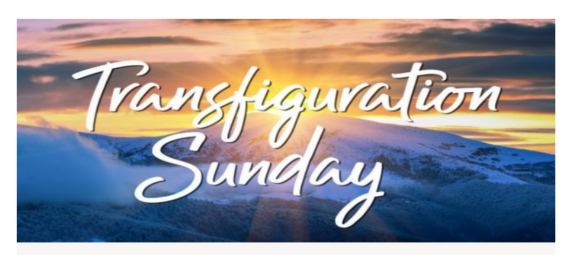
February 11, 2024—Transfiguration/Boy Scout Sunday "A Mountaintop Experience" Mark 9: 2-9

Join us for our Ash Wednesday Service on February 14th at 7:00PM in the Chapel.