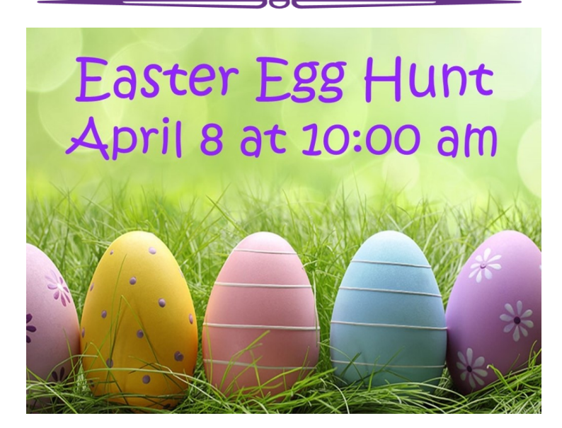
Candy donations are needed for the Easter Egg Hunt. Please leave them on the table in the Narthex by Sunday, April 2.